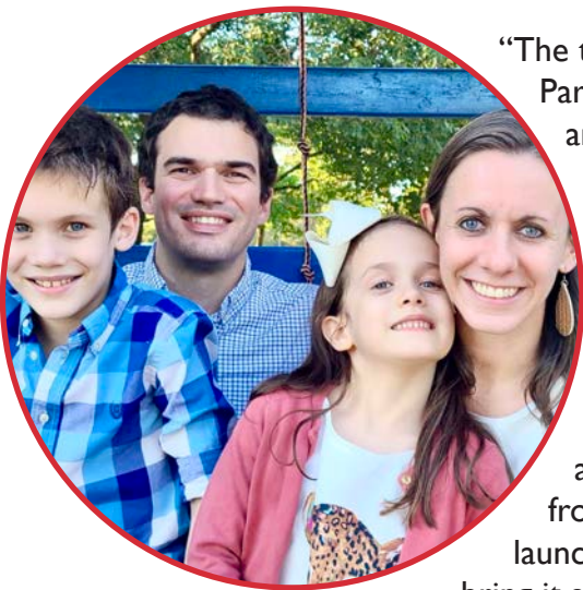
The MAGI Project