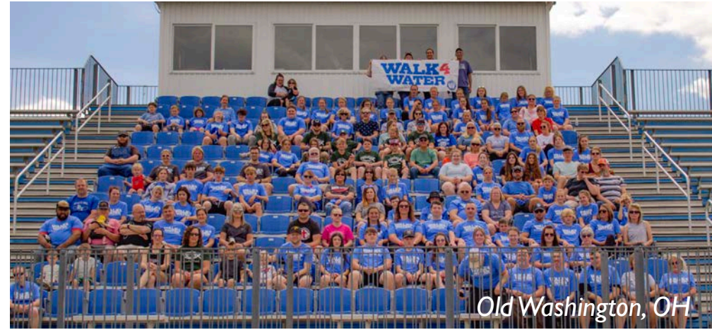
Old Washington, OH