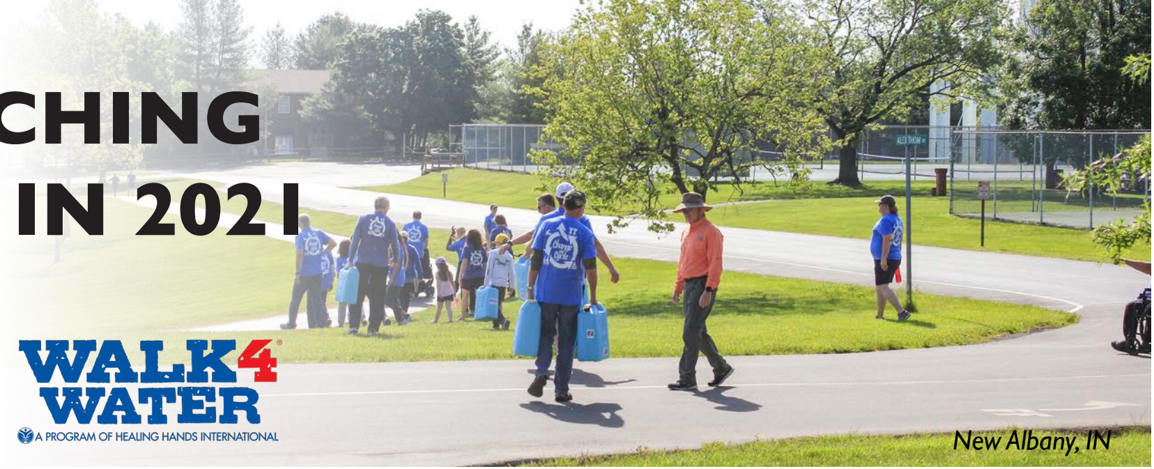
New Albany, IN